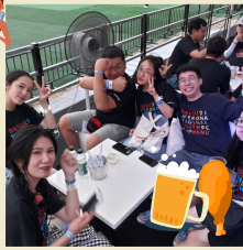
Chicken & Beer Festival