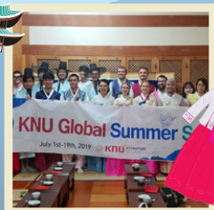
Traditional Hanbok Clothing