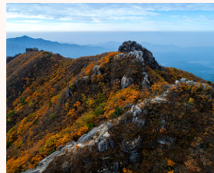
▲ Mt. Palgong