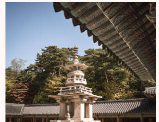
▲ Bulgugsa, Gyeongju