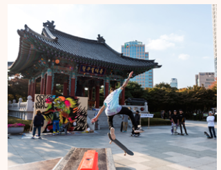
▲ Gukchae-bosang Memorial Park

Learning about traditional culture of various flavors, including Confucianism and Buddhism, is within easy grasp in Daegu through several area academies and temples, including the beautiful Dongwhasa complex on Mt. Palgong. Korea's patriotic history comes alive at many memorials, such as the downtown Gukchae-bosang Memorial Park. Downtown also features a traditional Korean herbal medicine market, along with many early churches that highlight Korea's Christian history. Daegu is the original home of Samsung Corporation and continues its innovative industrial heritage today through robotics, medicine, and IoT, among other industries. The nearby Gyeongju, historically known as Seorabeol, is a coastal city in the far southeastern corner of North Gyeongsang Province in South Korea. It is the second largest city by area in the province after Andong, covering 1,324 km 2 with a population of 264,091 people.